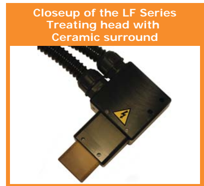
Closeup of the LF Series Treating head with Ceramic surround