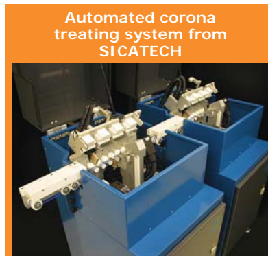
Automated corona treating system from SICATECH