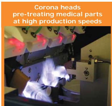
Corona heads pre-treating medical parts at high production speeds