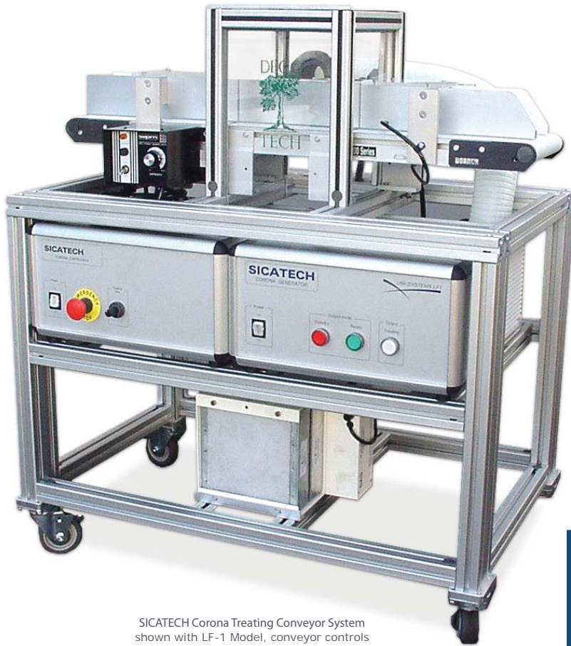
SICATECH Corona Treating Conveyor System shown with LF-1 Model, conveyor controls & SAS-200 ozone scrubber